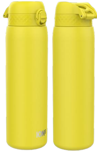
I8SS1000YEL STAINLESS STEEL - 1200ML YELLOW