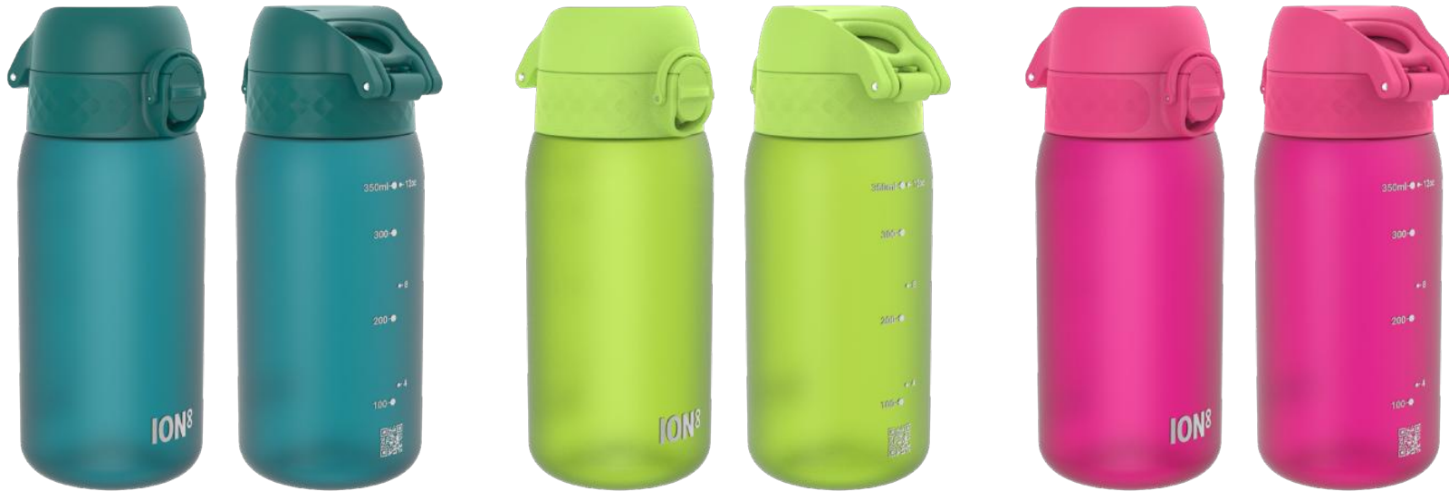
I8RF350AQU RECYCLON - 350ML AQUA