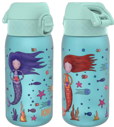
I8RF350PBMER RECYCLON - 350ML MERMAIDS