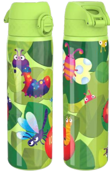
I8SS600PGBUGS STAINLESS STEEL - 600ML BUGS LIFE