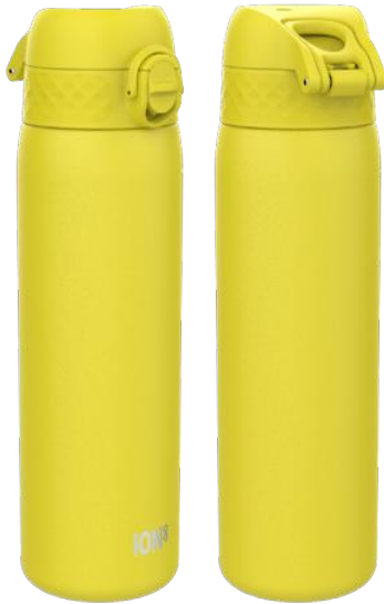
18SS600YEL STAINLESS STEEL - 600ML YELLOW