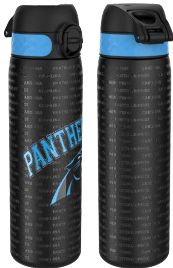
18SS600NFLCCAR STAINLESS STEEL - 600ML CAROLINA PANTHERS