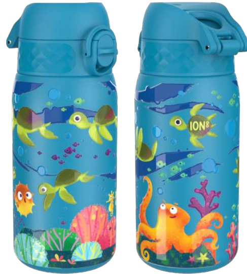
18SS400PBSEATUR STAINLESS STEEL - 400ML SEA TURTLE