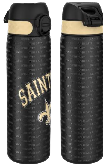
18SS600NFLCNO STAINLESS STEEL - 600ML NEW ORLEANS SAINTS