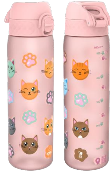
I8RF500PRCATS RECYCLON - 500ML CATS