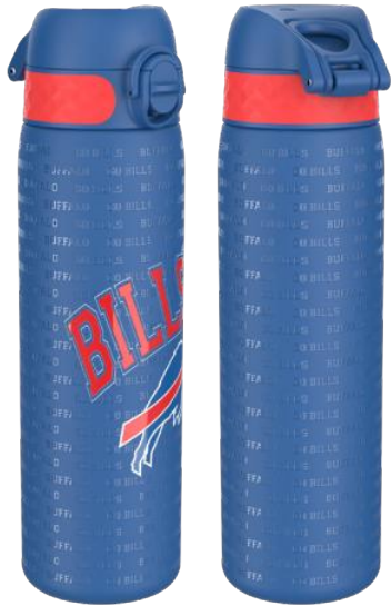
18SS600NFLCBUF STAINLESS STEEL - 600ML BUFFALO BILLS