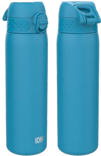
I8TS500BLU INSULATED STEEL - 500ML BLUE