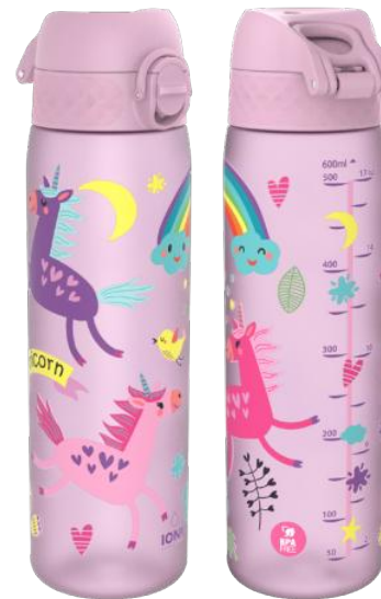
I8RF500PPUNIC RECYCLON - 500ML UNICORN