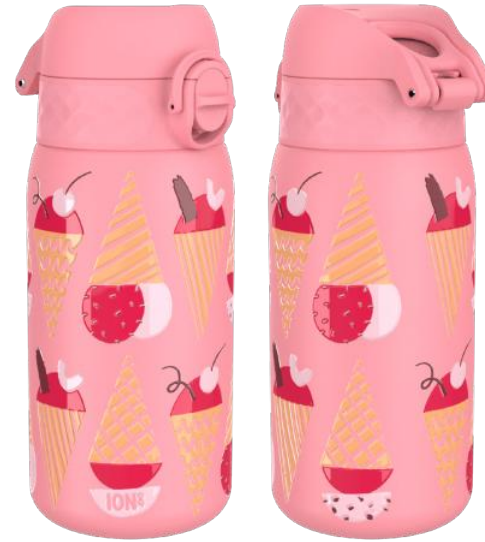
I8SS400PPICECR STAINLESS STEEL - 400ML ICE CREAMS