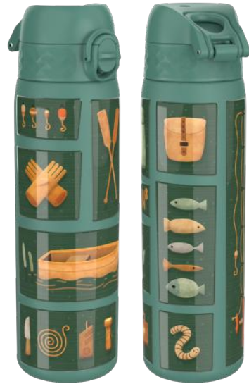
I8TS500PGFISHIN INSULATED STEEL - 500ML FISHING