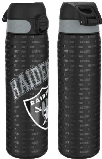
18SS600NFLCLVR STAINLESS STEEL - 600ML LAS VEGAS RAIDERS