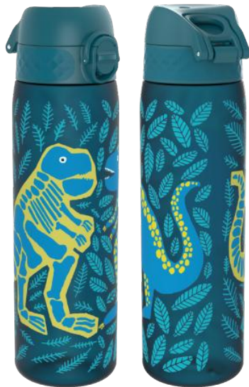
I8RF500PTDINO RECYCLON - 500ML DINOSAURS