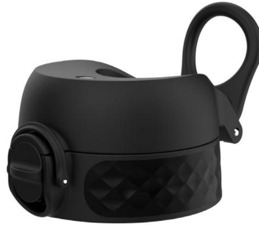
I8RLIDV2LRG REPLACEMENT LID FOR LARGE & EXTRA LARGE BOTTLES