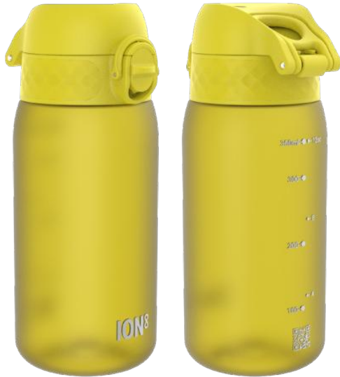
I8RF350YEL RECYCLON - 350ML YELLOW