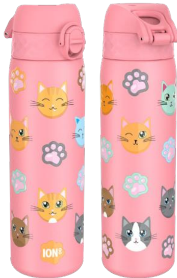
18SS600PRCATS STAINLESS STEEL - 600ML CATS