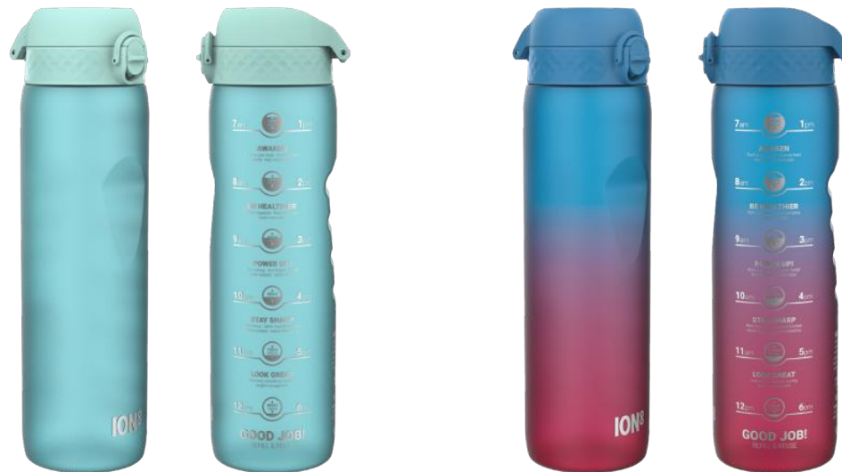
I8RF1000PB MOT2 RECYCLON - 1000ML SONIC BLUE MOTIVATOR