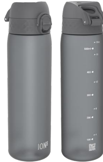
I8RF500GRY RECYCLON - 500ML GREY