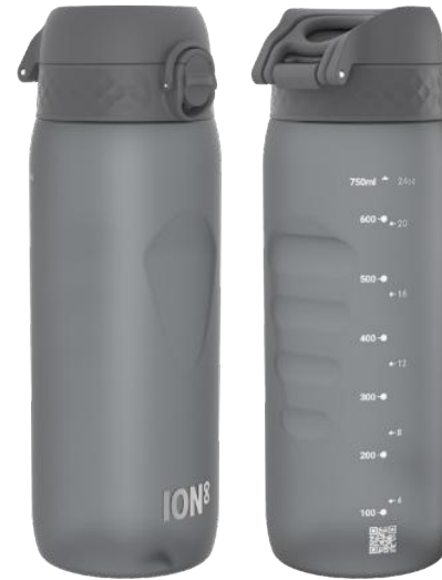
I8RF750GRY RECYCLON - 750ML GREY