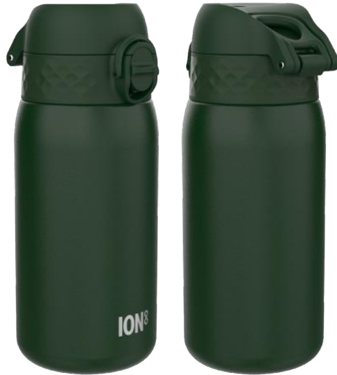
I8TS320DGRE INSULATED STEEL - 320ML DARK GREEN