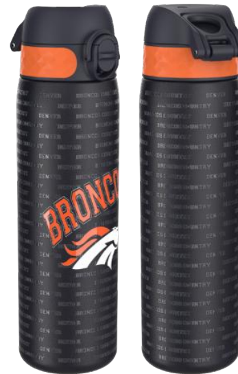
18SS600NFLCDEN STAINLESS STEEL - 600ML DENVER BRONCOS