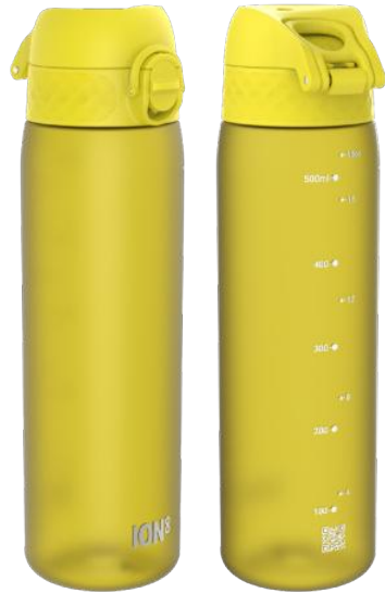
I8RF500YEL RECYCLON - 500ML YELLOW