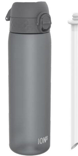
I8RF500GRYXS BOTTLE & STRAW GREY