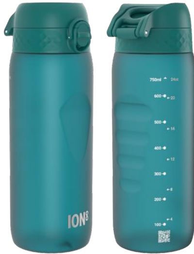
I8RF750AQU RECYCLON - 750ML AQUA