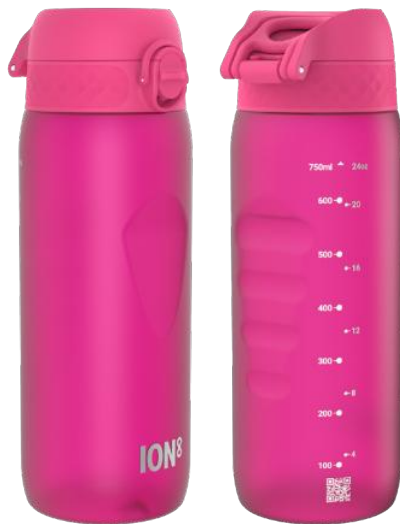
I8RF750PIN RECYCLON - 750ML PINK