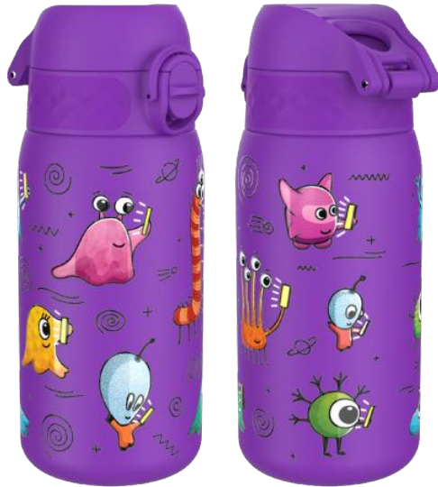
18SS400PVALIEN STAINLESS STEEL - 400ML ALIENS