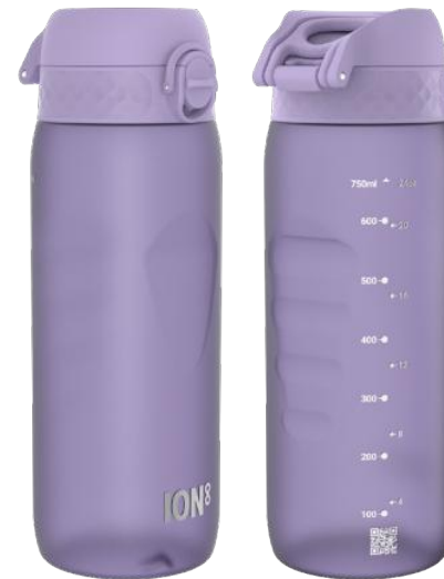
I8RF750PERI RECYCLON - 750ML PERIWINKLE