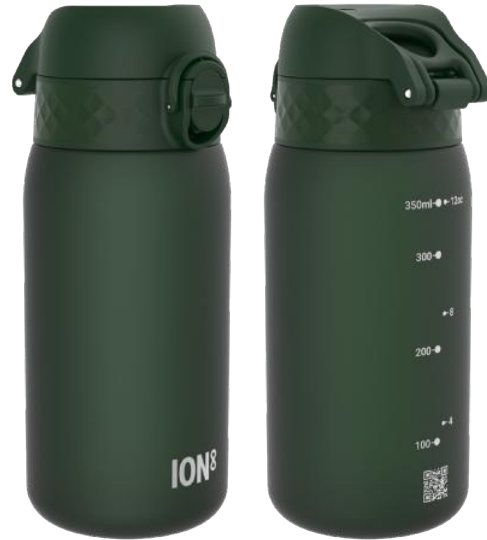
I8RF350DGRE RECYCLON - 350ML DARK GREEN