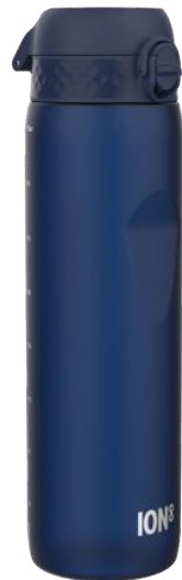
I8RF1000NAV RECYCLON - 1000ML NAVY