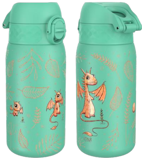
I8SS400PTDRAG STAINLESS STEEL - 400ML DRAGONS