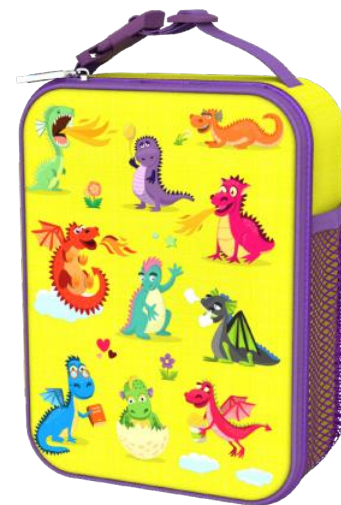
18LBYDRAG LUNCH BAG DRAGONS