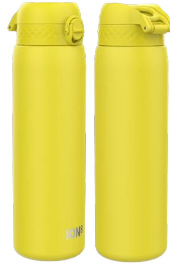
18TS1000YEL INSULATED STEEL - 920ML YELLOW