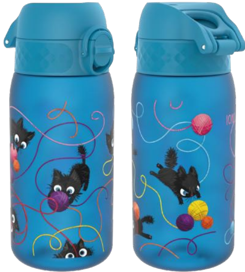
I8RF350PBCATS RECYCLON - 350ML CATS