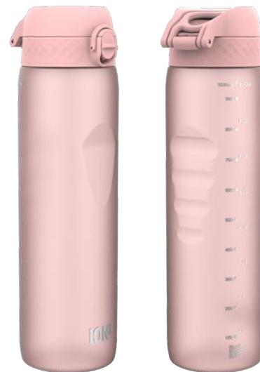
I8RF1000ROS RECYCLON - 1000ML ROSE QUARTZ