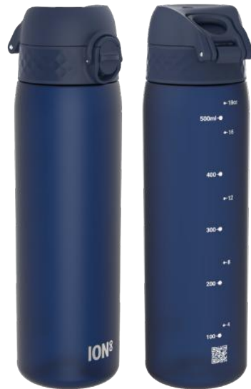
I8RF500NAV RECYCLON - 500ML NAVY