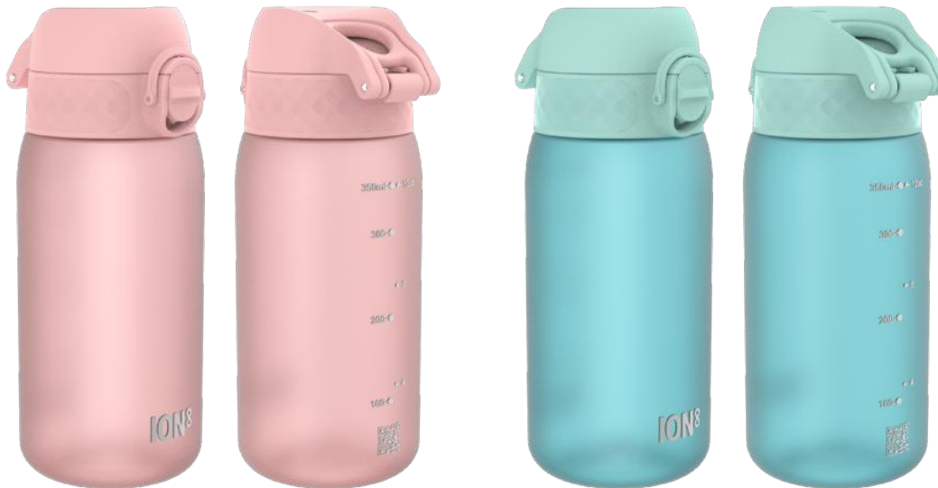
I8RF350ROS RECYCLON - 350ML ROSE QUARTZ