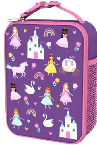
I8LBVPRIN LUNCH BAG PRINCESS