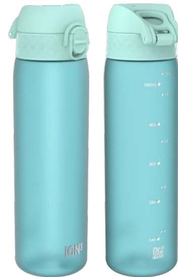
I8RF500BLU2 RECYCLON - 500ML SONIC BLUE