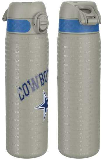
18SS600NFLDAL STAINLESS STEEL - 600ML DALLAS COWBOYS