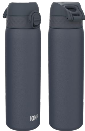
I8TS500NAVY INSULATED STEEL - 500ML ASH NAVY