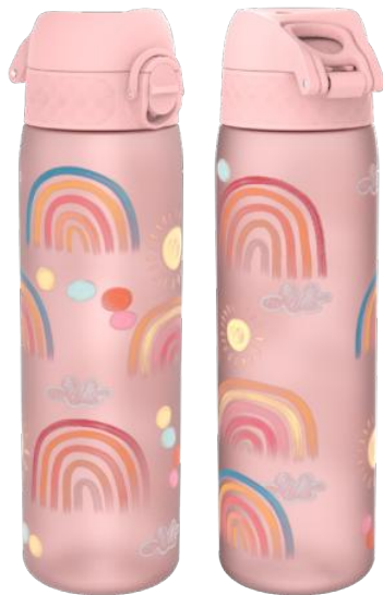
I8RF500PPRAINB2 RECYCLON - 500ML RAINBOWS