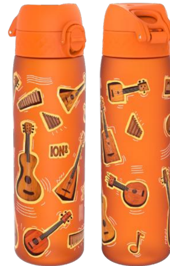
I8RF500POMUSIC RECYCLON - 500ML MUSIC