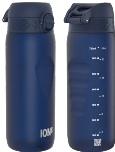
I8RF750NAV RECYCLON - 750ML NAVY