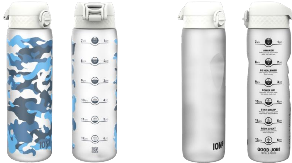
I8RF1000PICAMO RECYCLON - 1000ML CAMOU MOTIVATOR NEW