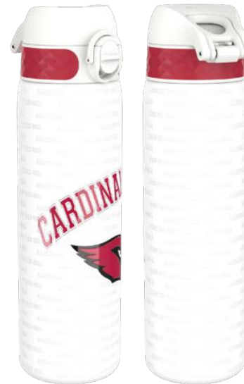
I8SS600NFLCARI STAINLESS STEEL - 600ML ARIZONA CARDINALS