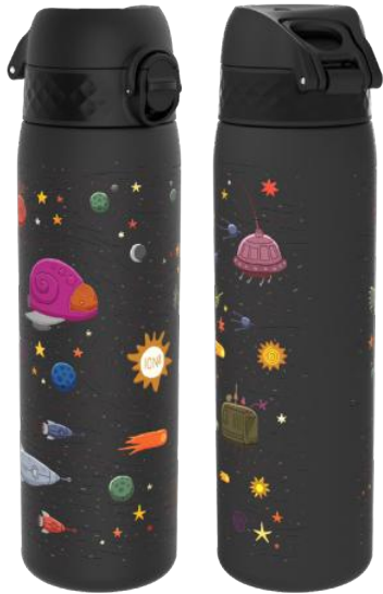
I8RF500PKSPACE RECYCLON - 500ML SPACESHIPS