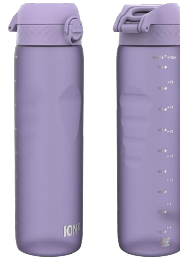
I8RF1000PERI RECYCLON - 1000ML PLAYFUL PERIWINKLE