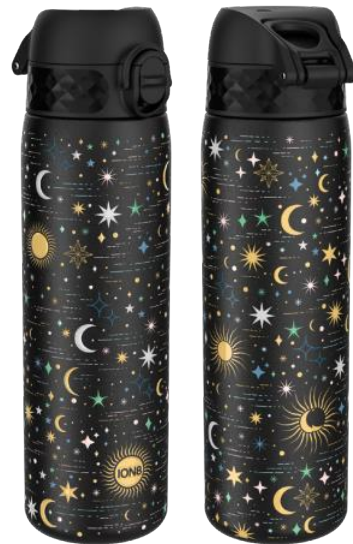
I8SS600PKCELES STAINLESS STEEL - 600ML CELESTIAL