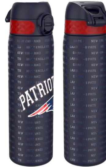
18SS600NFLCNE STAINLESS STEEL - 600ML NEW ENGLAND PATRIOTS