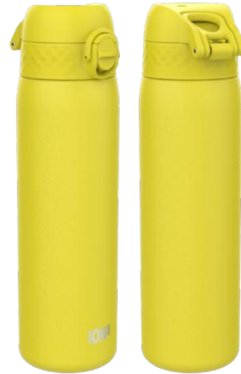
I8TS500YEL INSULATED STEEL - 500ML YELLOW