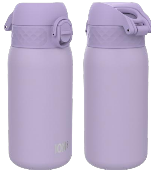
I8TS320PERI INSULATED STEEL - 320ML PERIWINKLE