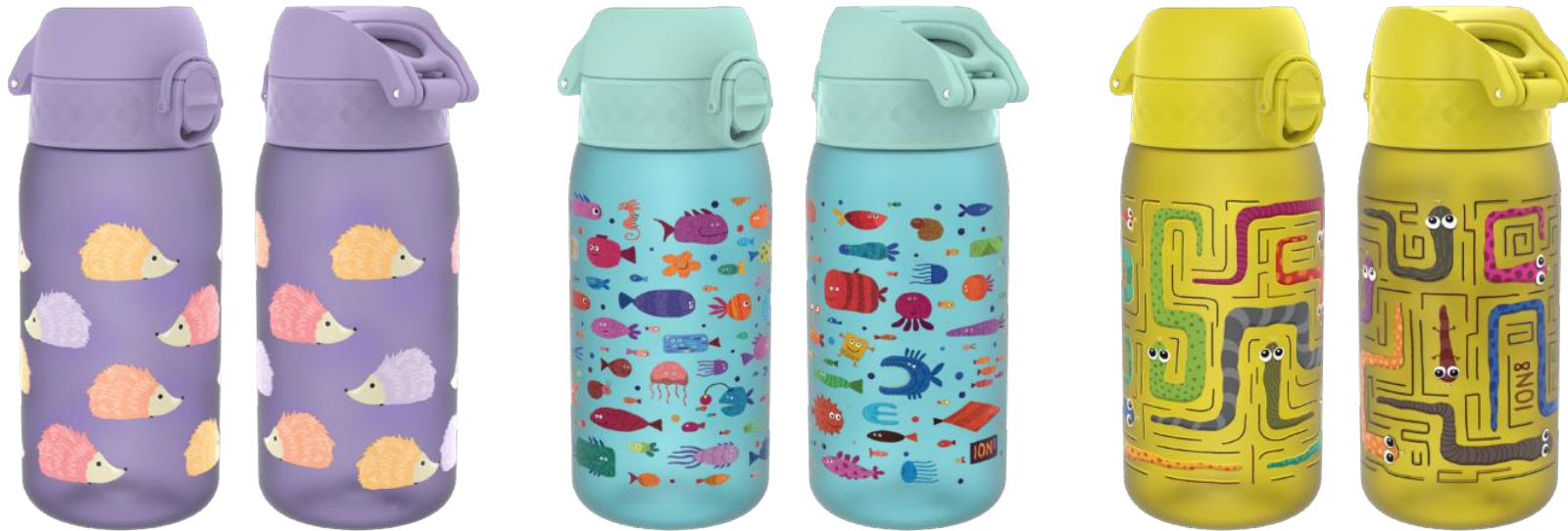
I8RF350PVHHOG RECYCLON - 350ML HEDGEHOGS