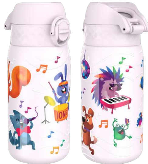
18SS400PVABAND STAINLESS STEEL - 400ML ANIMAL BAND