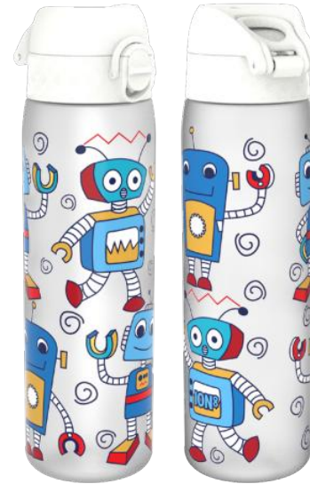
I8RF500PIROBOT RECYCLON - 500ML ROBOTS