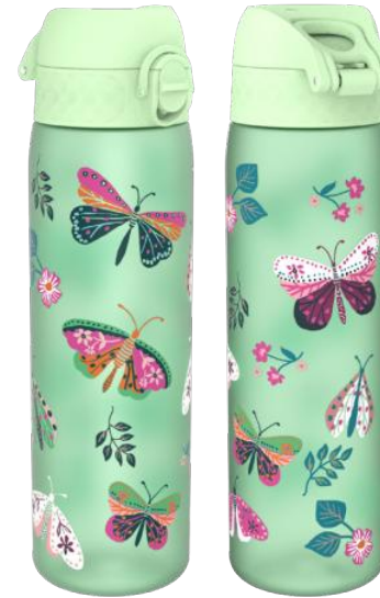
I8RF500PGBFLY2 RECYCLON - 500ML WILD BUTTERFLIES