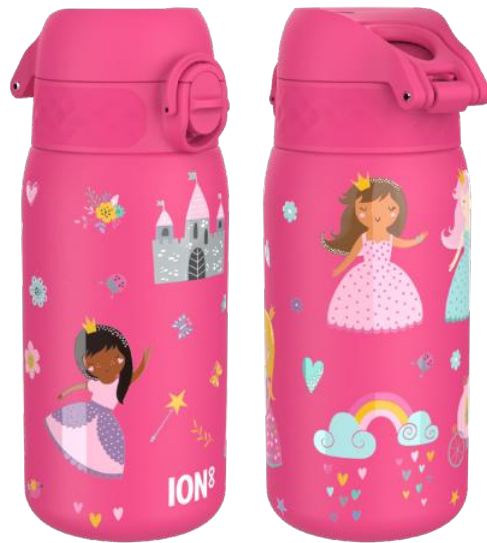
I8SS400PPPRIN STAINLESS STEEL - 400ML PRINCESS