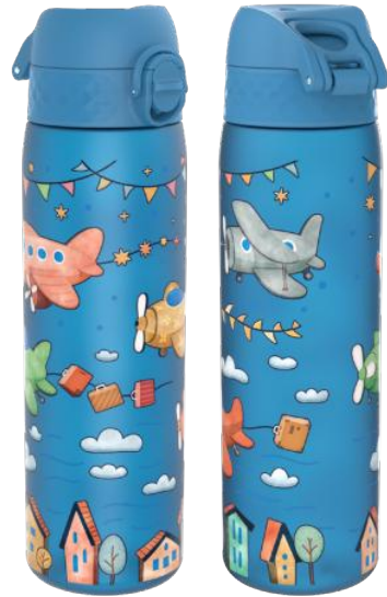
I8RF500PBPLANES RECYCLON - 500ML AIRPLANES