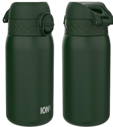
I8SS400DGRE STAINLESS STEEL - 400ML DARK GREEN