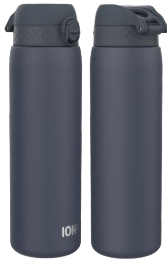
I8TS1000NAVY INSULATED STEEL - 920ML ASH NAVY