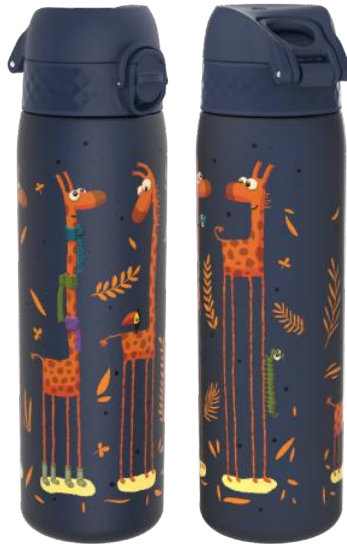
I8RF500PNGIRAF RECYCLON - 500ML GIRAFFES