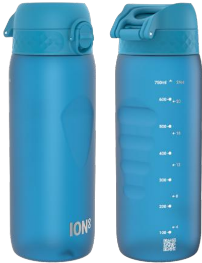
I8RF750BLU RECYCLON - 750ML BLUE