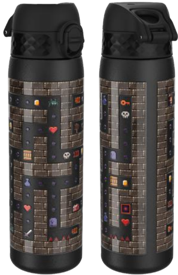
18SS600PKGAME STAINLESS STEEL - 600ML GAMER