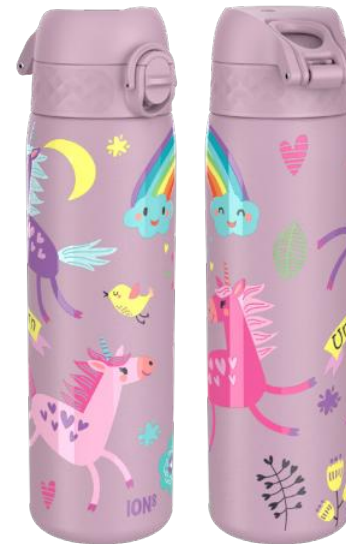
18SS600PVUNIC STAINLESS STEEL - 600ML UNICORNS