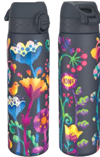
I8TS500PNFLO INSULATED STEEL - 500ML FLORAL