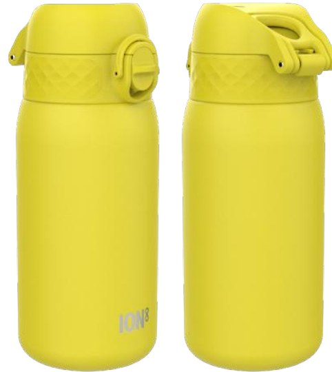
I8TS320YEL INSULATED STEEL - 320ML YELLOW