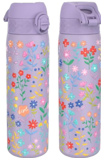
I8TS500PVFLOW INSULATED STEEL - 500ML DELICATE FLORAL