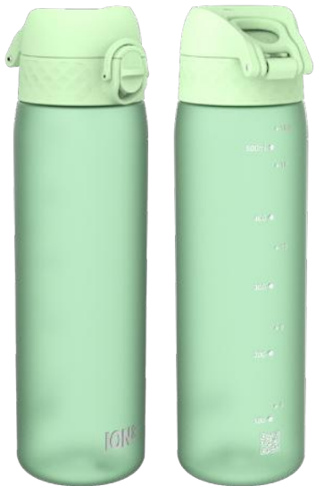
I8RF500SGRE2 RECYCLON - 500ML SURF GREEN