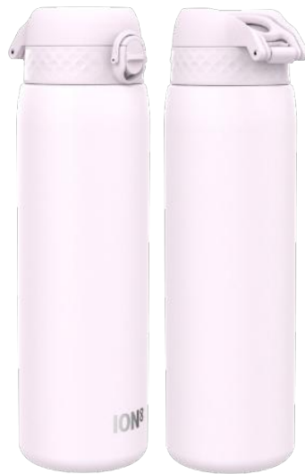
I8SS1000LIL2 STAINLESS STEEL - 1200ML LILAC DUSK