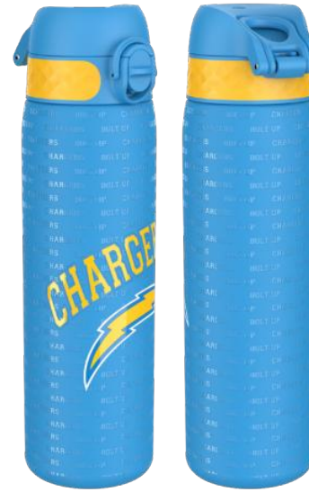
18SS600NFLCLAC STAINLESS STEEL - 600ML LOS ANGELES CHARGERS