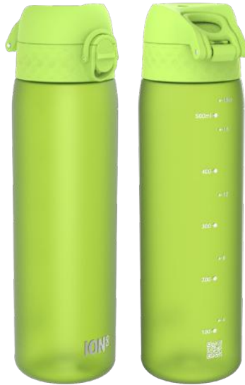
I8RF500GRE RECYCLON - 500ML GREEN