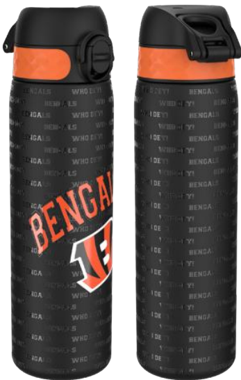
18SS600NFLCCIN STAINLESS STEEL - 600ML CINCINNATI BENGALS