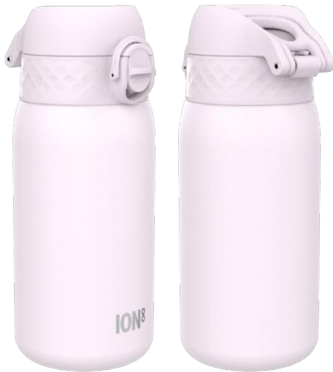
I8SS400LIL2 STAINLESS STEEL - 400ML LILAC DUSK