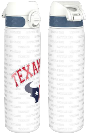
18SS600NFLCHOU STAINLESS STEEL - 600ML HOUSTON TEXANS