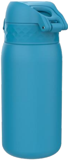
I8TS320BLU INSULATED STEEL - 320ML BLUE