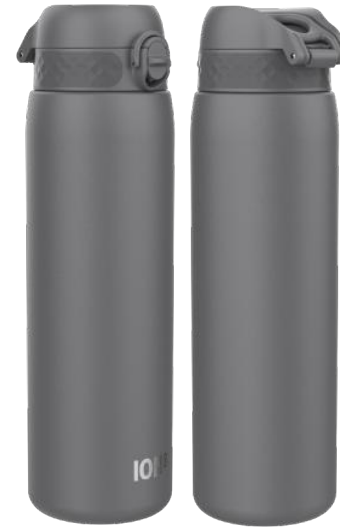
I8TS1000GRY INSULATED STEEL - 920ML GREY