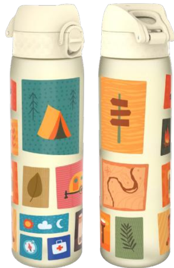
I8RF500PYCAMP RECYCLON - 500ML CAMPING