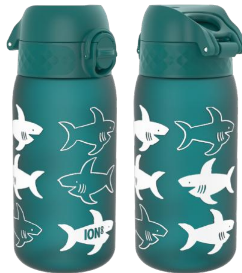
I8RF350PBSHARK RECYCLON - 350ML SHARKS