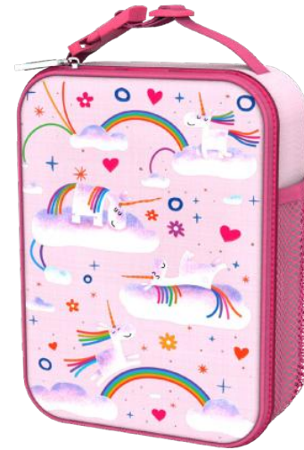
18LBPUNIRAIN LUNCH BAG UNICORN RAINBOWS