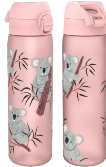
I8RF500PPKOALA2 RECYCLON - 500ML KOALA