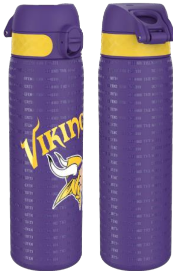
18SS600NFLCMIN STAINLESS STEEL - 600ML MINNESOTA VIKINGS