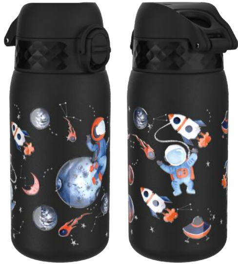
I8SS400PKSPACE2 STAINLESS STEEL - 400ML SPACE