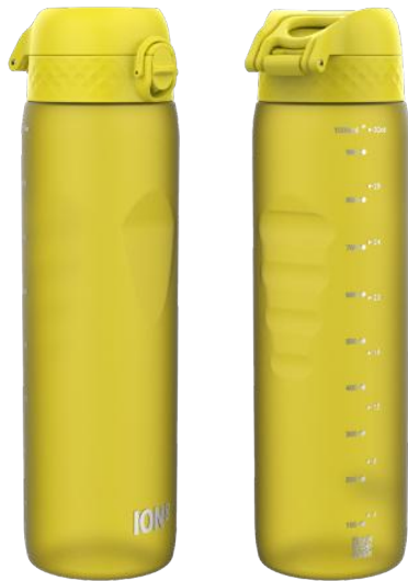
I8RF1000YEL RECYCLON - 1000ML YELLOW