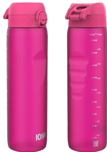
I8RF1000PIN RECYCLON - 1000ML PINK