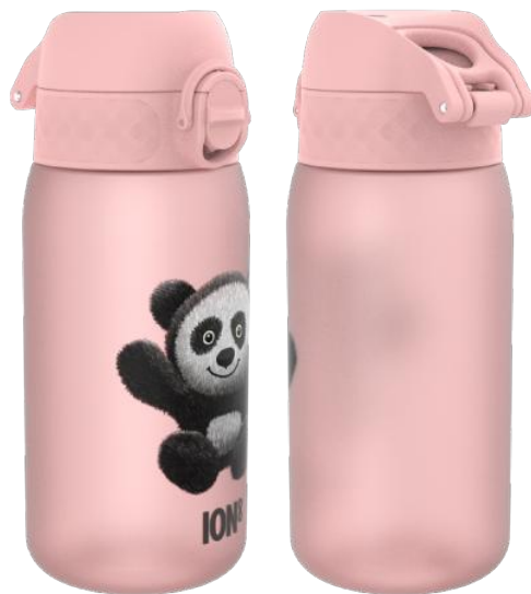
I8RF350PPPANDA RECYCLON - 350ML PANDA