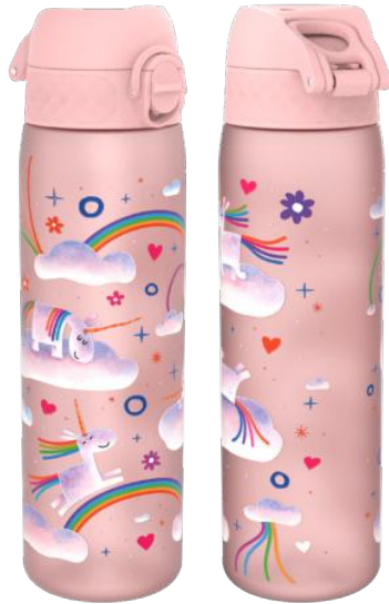
I8RF500PPUNIRAIN RECYCLON - 500ML UNICORN RAINBOWS