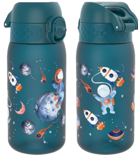
I8RF350PTSPACE RECYCLON - 350ML SPACE