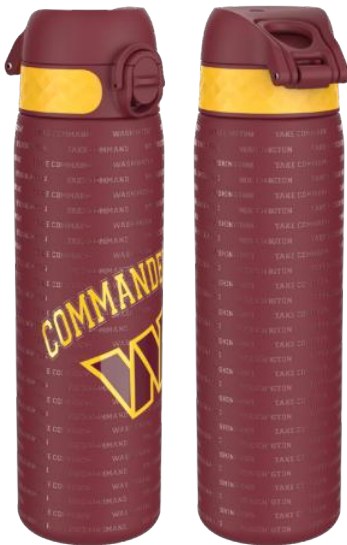
18SS600NFLCWAS STAINLESS STEEL - 600ML WASHINGTON COMMANDERS