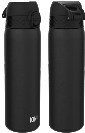
I8TS500BLK INSULATED STEEL - 500ML BLACK