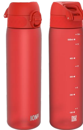
I8RF500RED RECYCLON - 500ML RED