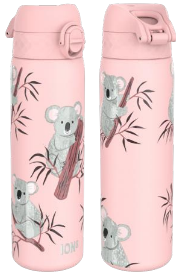
I8TS500PPKOALA INSULATED STEEL - 500ML KOALA