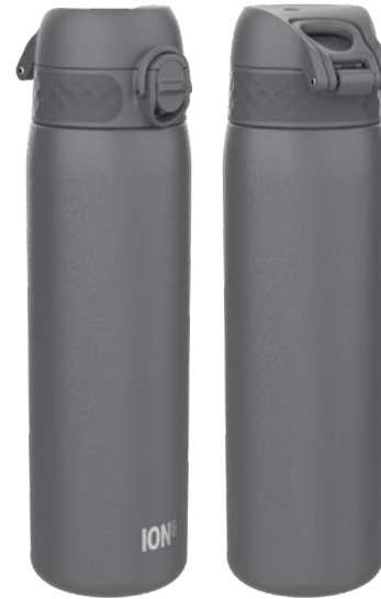
I8TS500GRY INSULATED STEEL - 500ML GREY