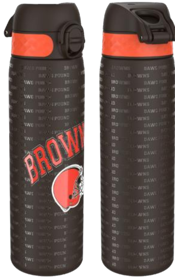
18SS600NFCCLC STAINLESS STEEL - 600ML CLEVELAND BROWNS