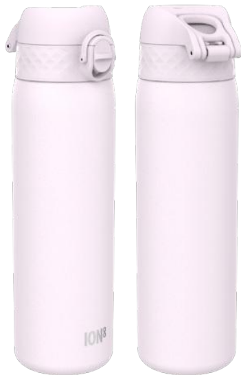
18SS600LIL2 STAINLESS STEEL - 600ML LILAC DUSK