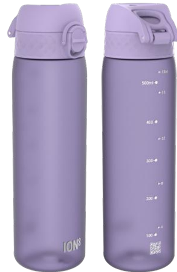
I8RF500PERI RECYCLON - 500ML PERIWINKLE