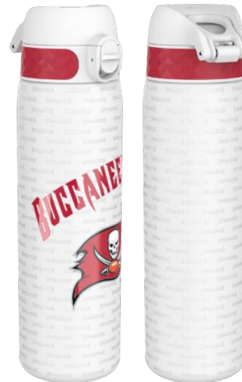
18SS600NFLCTB STAINLESS STEEL - 600ML TAMPA BAY BUCCANEERS