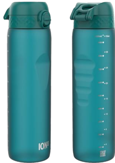
I8RF1000AQU RECYCLON - 1000ML AQUA