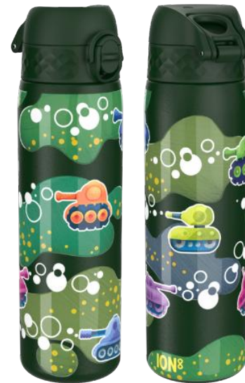
I8SS600PGTANKS STAINLESS STEEL - 600ML TANKS