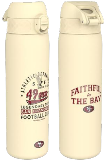
I8SS600NFLESAF STAINLESS STEEL - 600ML SAN FRANCISCO 49'ERS