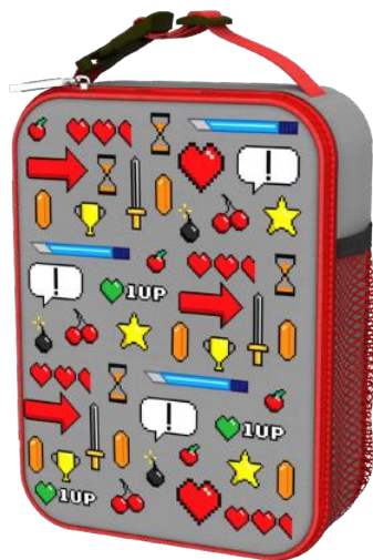
18LBGGAME LUNCH BAG GAMER