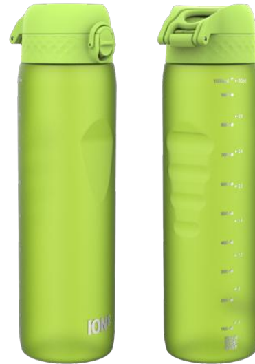
I8RF1000GRE RECYCLON - 1000ML GREEN