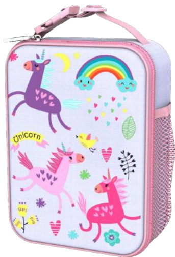
18LBVUNIC LUNCH BAG UNICORNS