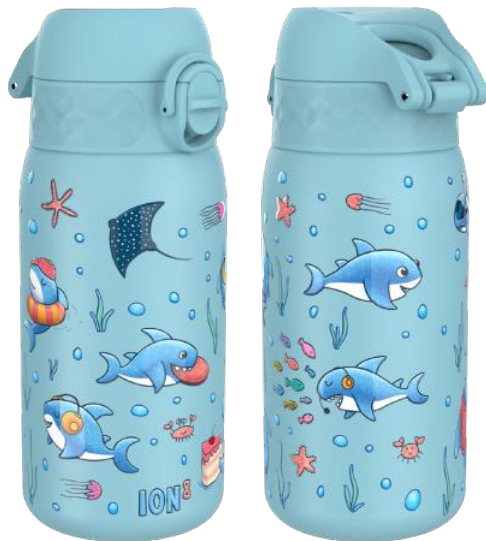
18SS400PBSHARK STAINLESS STEEL - 400ML SHARKS