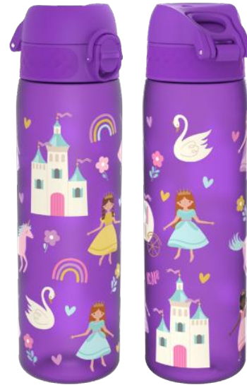
I8RF500PVPRIN RECYCLON - 500ML PRINCESS