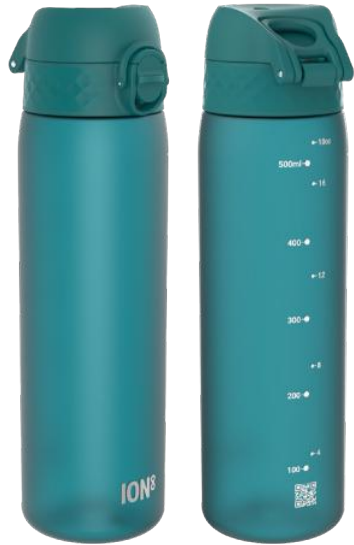
I8RF500AQU RECYCLON - 500ML AQUA