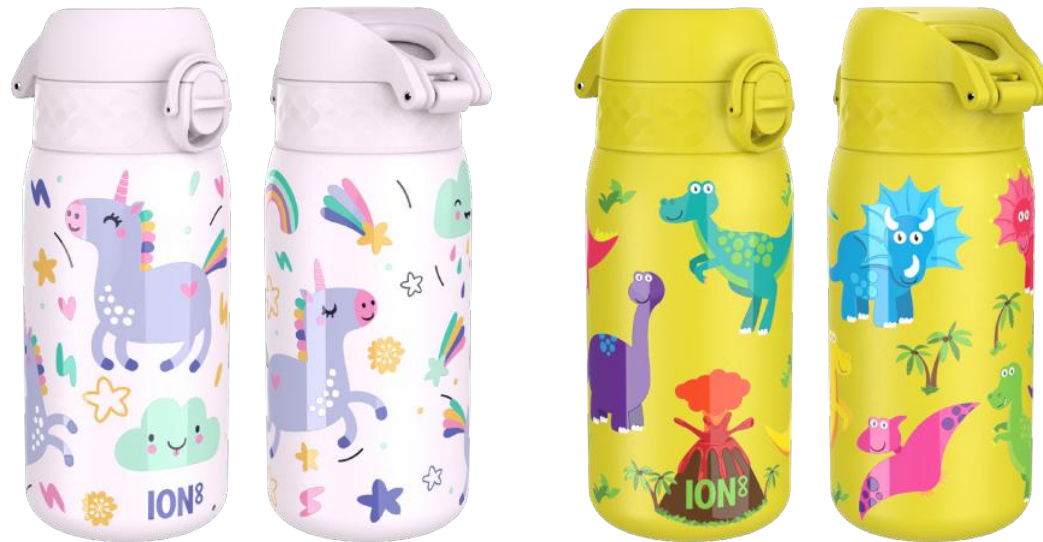
18TS320PPUNIC INSULATED STEEL - 320ML UNICORNS