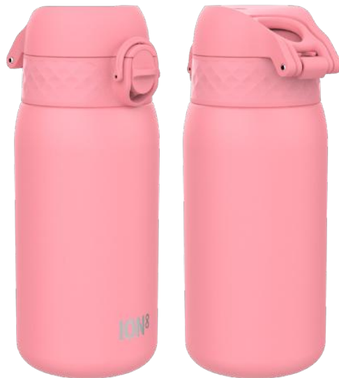
I8TS320ROSEB INSULATED STEEL - 320ML ROSE BLOOM