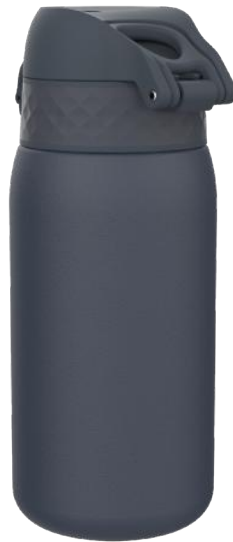
I8TS320NAVY INSULATED STEEL - 320ML ASH NAVY