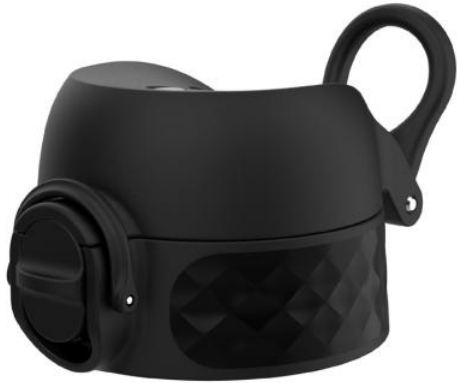
I8RLIDV2SML REPLACEMENT LID FOR SMALL & MEDIUM BOTTLES