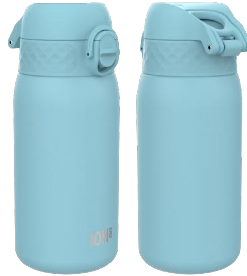
I8SS400ABLU2 STAINLESS STEEL - 400ML ALASKAN BLUE