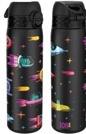
I8SS600PKSPACE STAINLESS STEEL - 600ML SPACE