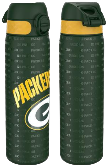
18SS600NFLCGB STAINLESS STEEL - 600ML GREEN BAY PACKERS