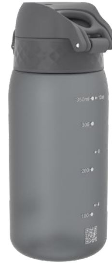
I8RF350GRY RECYCLON - 350ML GREY