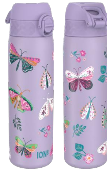
I8TS500PVBFLY INSULATED STEEL - 500ML BUTTERFLYS