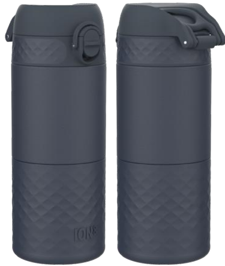
I8HS360NAVY INSULATED STEEL - 360ML ASH NAVY