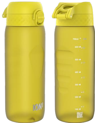
I8RF750YEL RECYCLON - 750ML YELLOW