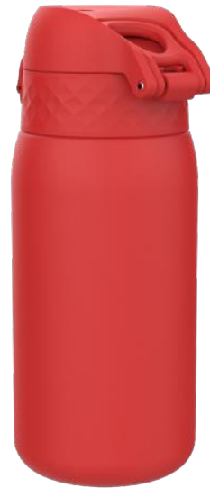
I8TS320RED INSULATED STEEL - 320ML RED