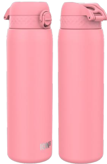
18TS1000ROSEB INSULATED STEEL - 920ML ROSE BLOOM