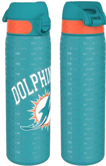
18SS600NFLCMIA STAINLESS STEEL - 600ML MIAMI DOLPHINS