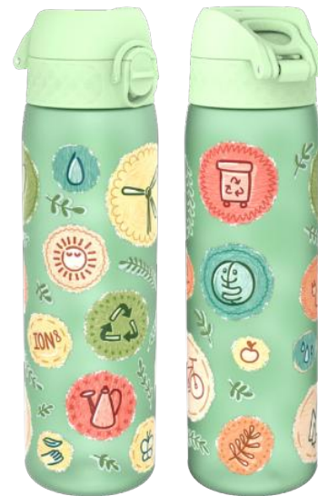
I8RF500PGECO RECYCLON - 500ML ECO