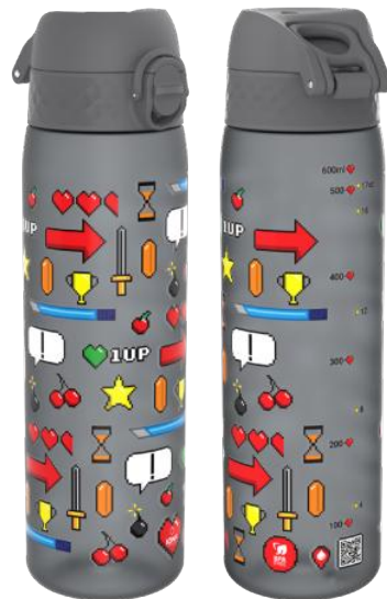
I8RF500PGGAME RECYCLON - 500ML GAMER