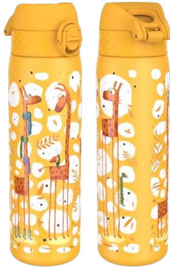
18SS600PYGIRAF STAINLESS STEEL - 600ML GIRAFFES BY DAY