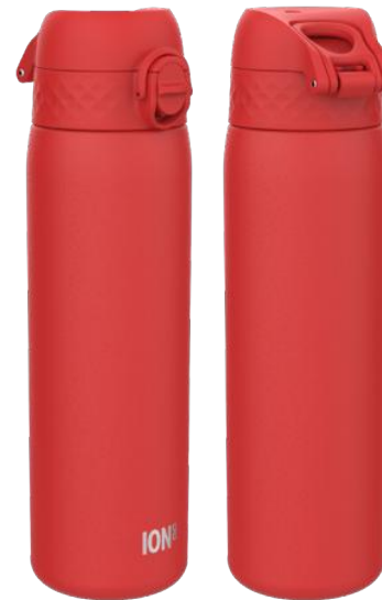
I8SS600RED STAINLESS STEEL - 600ML RED