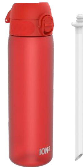
I8RF500REDXS BOTTLE & STRAW RED