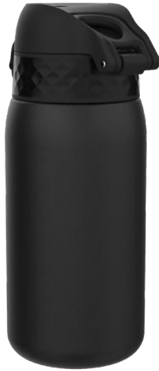
I8TS320BLK INSULATED STEEL - 320ML BLACK