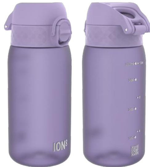
I8RF350PERI RECYCLON - 350ML PERIWINKLE