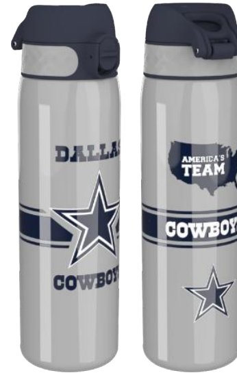
I8SS600NFLEDAL STAINLESS STEEL - 600ML DALLAS COWBOYS