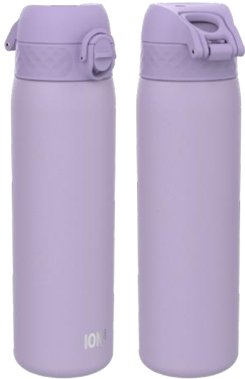
18SS600PERI STAINLESS STEEL - 600ML PERIWINKLE