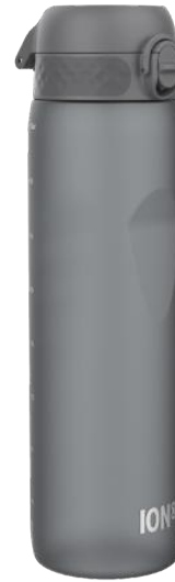
I8RF1000GRY RECYCLON - 1000ML GREY