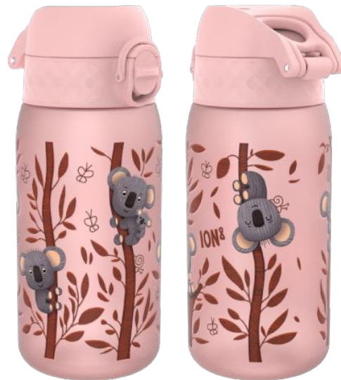
I8RF350PPKOALA RECYCLON - 350ML KOALAS