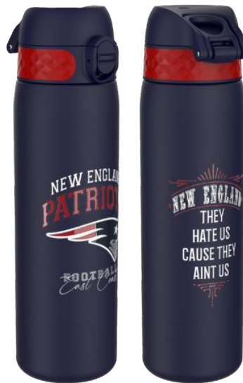
I8SS600NFLENE STAINLESS STEEL - 600ML NEW ENGLAND PATRIOTS