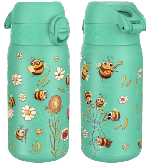
I8TS320PTBEES INSULATED STEEL - 320ML BEES