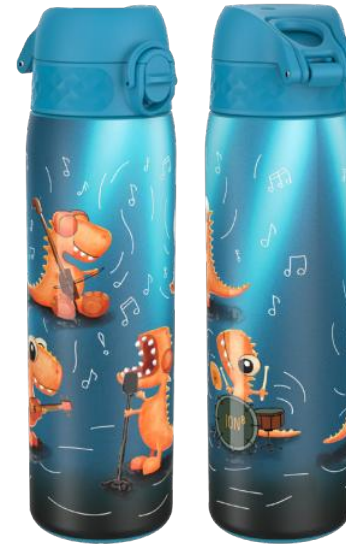
18SS600PBDINO STAINLESS STEEL - 600ML DINO BAND