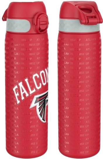
I8SS600NFLCATL STAINLESS STEEL - 600ML ATLANTA FALCONS