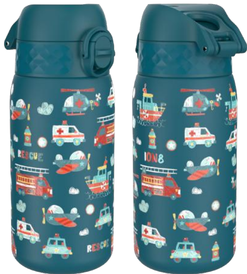
18SS400PTRESCUE STAINLESS STEEL - 400ML RESCUE VEHICLES