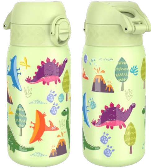
I8SS400PGDINO STAINLESS STEEL - 400ML DINOSAURS