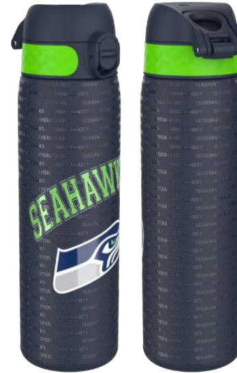
I8SS600NFLCSEA STAINLESS STEEL - 600ML SEATTLE SEAHAWKS