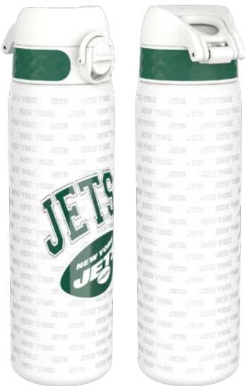
18SS600NFLCNYJ STAINLESS STEEL - 600ML NEW YORK JETS