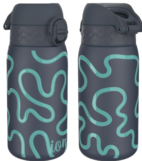
I8TS320PNSQUIG INSULATED STEEL - 320ML SQUIGGLY LINE