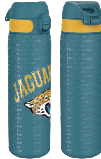
18SS600NFCJAX STAINLESS STEEL - 600ML JACKSONVILLE JAGUARS