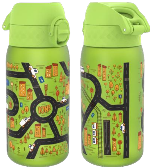
I8RF350PGCARS RECYCLON - 350ML CARS