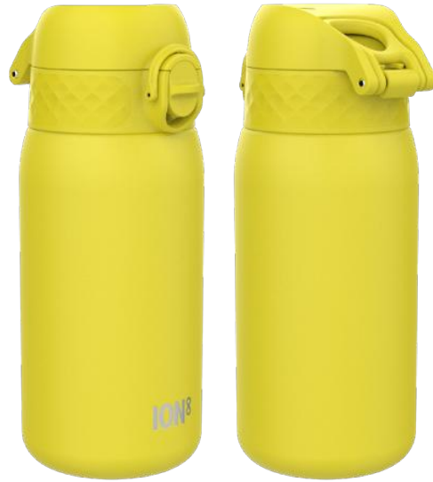
I8SS400YEL STAINLESS STEEL - 400ML YELLOW