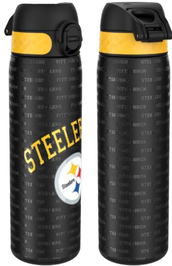
18SS600NFCPIT STAINLESS STEEL - 600ML PITTSBURGH STEELERS