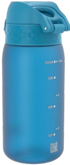
I8RF350BLU RECYCLON - 350ML BLUE