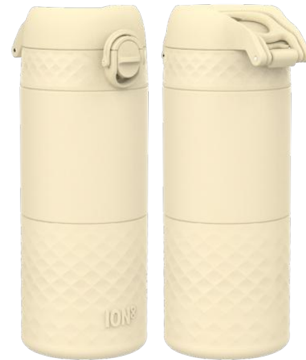
I8HS360TUBE INSULATED STEEL - 360ML TUBEROSE