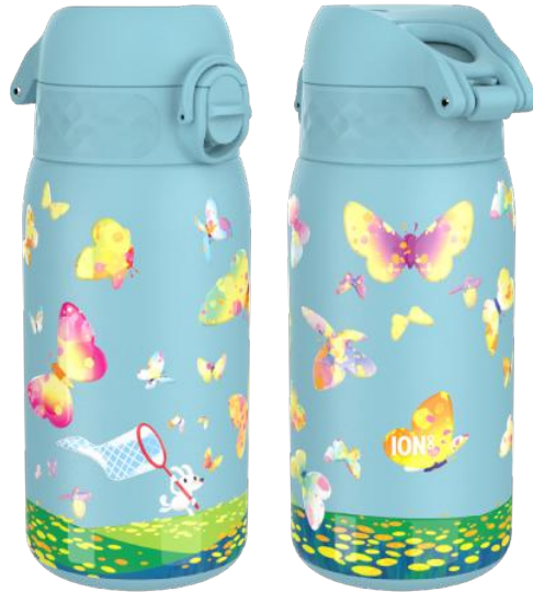
I8TS320PBBFLY INSULATED STEEL - 320ML BUTTERFLIES