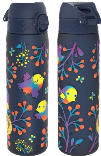
I8RF500PNBIRDS RECYCLON - 500ML BIRDS