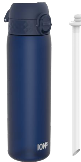
I8RF500NAVXS BOTTLE & STRAW NAVY