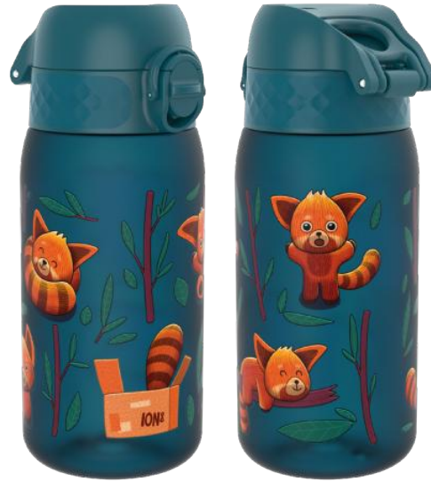
I8RF350PTREDP RECYCLON - 350ML RED PANDAS