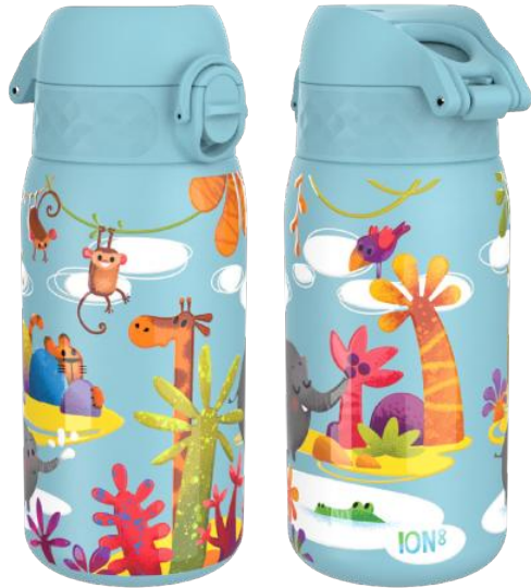
18SS400PBSAFARI STAINLESS STEEL - 400ML SAFARI