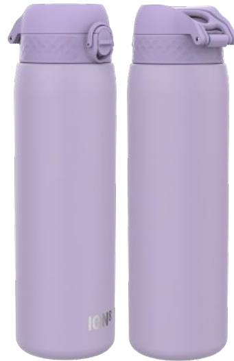
18TS1000PERI INSULATED STEEL - 920ML PERIWINKLE