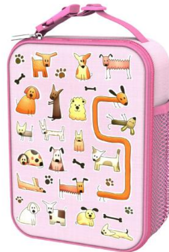
I8LBPDOGS LUNCH BAG DOGS