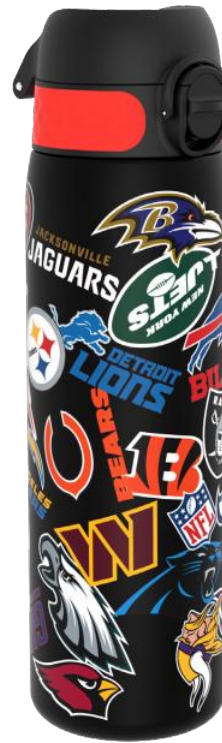
I8RF500NFLPATCH RECYCLON - 500ML MULTI TEAM DESIGN