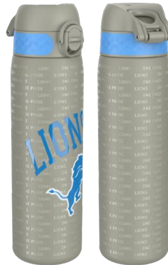
18SS600NFLCDET STAINLESS STEEL - 600ML DETROIT LIONS