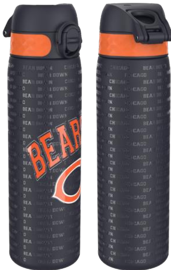
18SS600NFLCCHI STAINLESS STEEL - 600ML CHICAGO BEARS