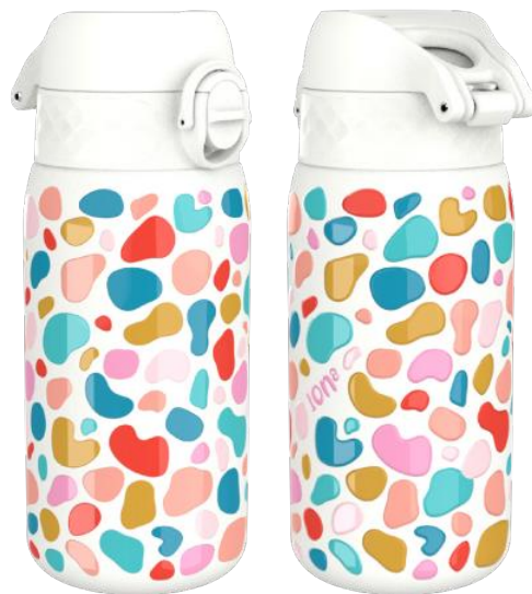
I8TS320PWSPLODGE INSULATED STEEL - 320ML SPLODGE