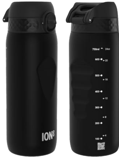
I8RF750BLK RECYCLON - 750ML BLACK