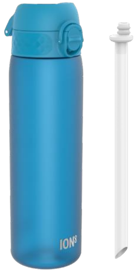
I8RF500BLUXS BOTTLE & STRAW BLUE