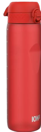
I8RF1000RED RECYCLON - 1000ML RED