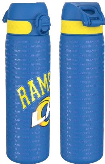
I8SS600NFLCLAR STAINLESS STEEL - 600ML LOS ANGELES RAMS