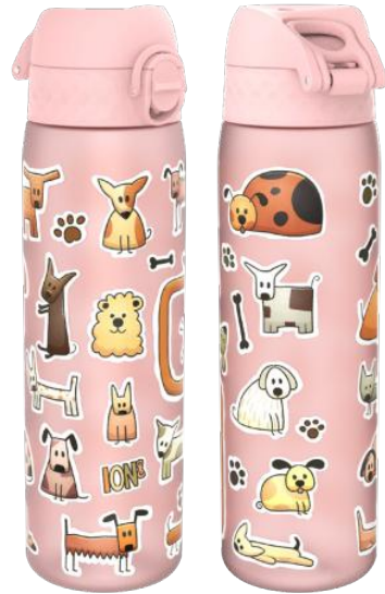
I8RF500PPDOGS RECYCLON - 500ML DOGS