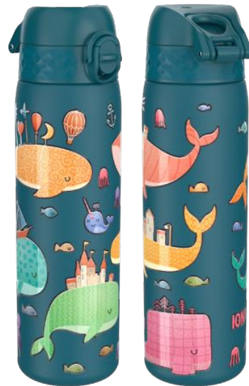
18SS600PTWHALES STAINLESS STEEL - 600ML WHALES