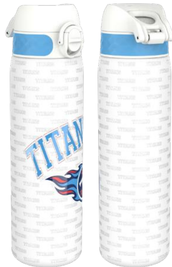
18SS600NFCITEN STAINLESS STEEL - 600ML TENNESSEE TITANS