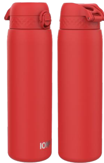
I8TS1000RED INSULATED STEEL - 920ML RED