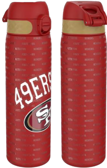
I8SS600NFLCSAF STAINLESS STEEL - 600ML SAN FRANCISCO 49'ERS