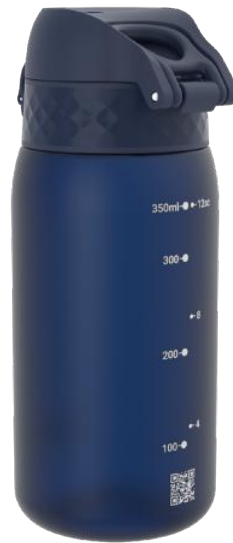
I8RF350NAV RECYCLON - 350ML NAVY