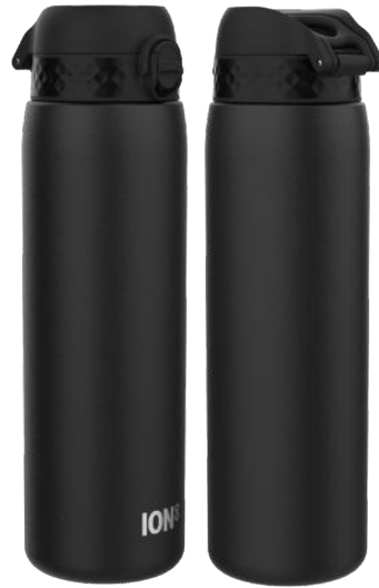
I8TS1000BLK INSULATED STEEL - 920ML BLACK