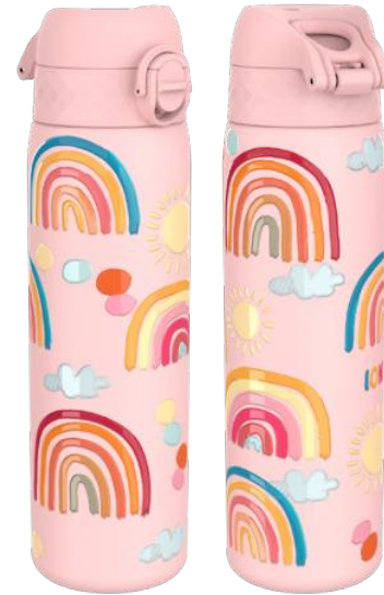
18SS600PPRAINB STAINLESS STEEL - 600ML RAINBOWS