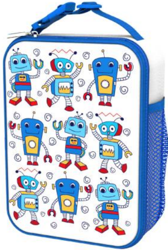
I8LBWROBOT LUNCH BAG ROBOTS