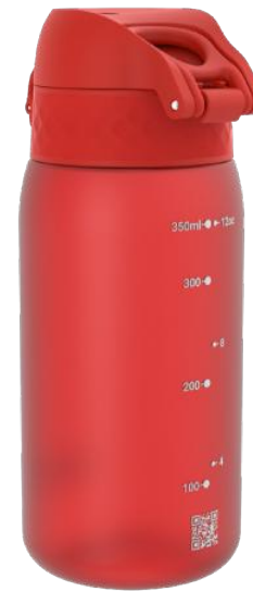
I8RF350RED RECYCLON - 350ML RED