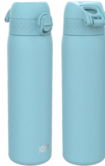
18SS600ABLU2 STAINLESS STEEL - 600ML ALASKAN BLUE