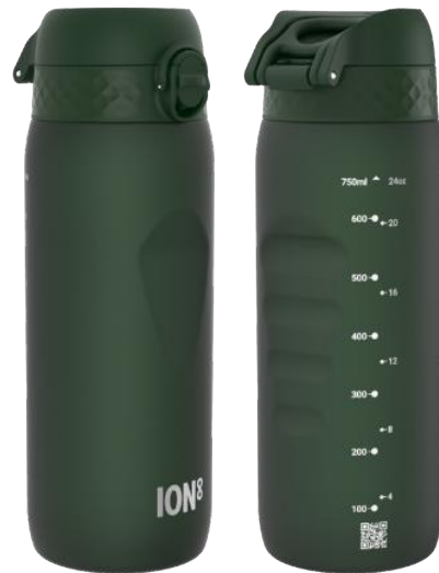
I8RF750DGRE RECYCLON - 750ML DARK GREEN