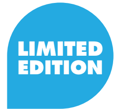
18TS320PYDINO INSULATED STEEL - 320ML DINOSAURS