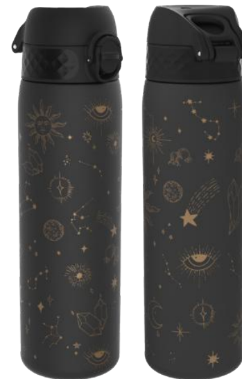
I8RF500PKCELES2 RECYCLON - 500ML CELESTIAL UNIVERSE