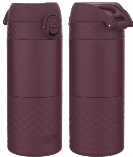
I8HS360BLB INSULATED STEEL - 360ML BLACKBERRY