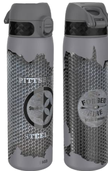
I8SS600NFLEPIT STAINLESS STEEL - 600ML PITTSBURGH STEELERS