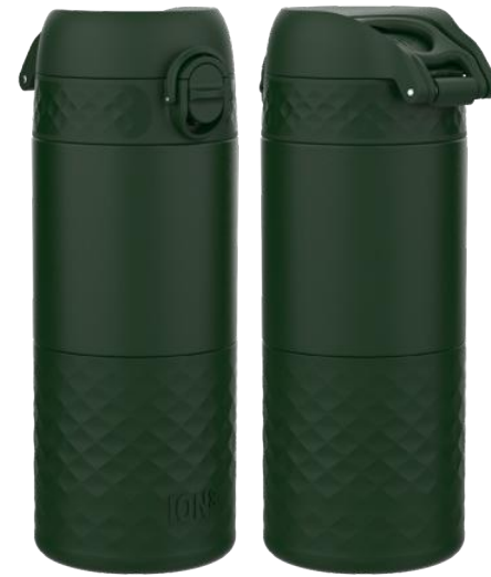
I8HS360DGRE INSULATED STEEL - 360ML DARK GREEN