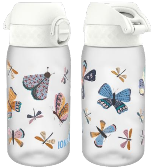
I8RF350PIBFLY RECYCLON - 350ML BUTTERFLIES