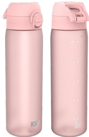
I8RF500ROS RECYCLON - 500ML ROSE QUARTZ