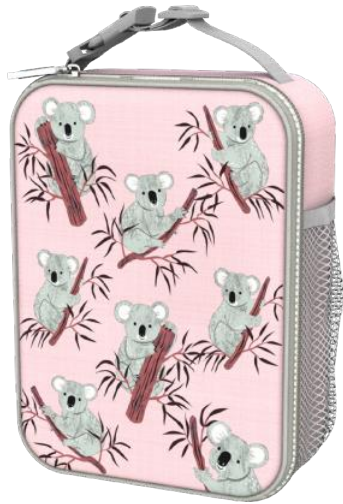
18LBPKOALA LUNCH BAG KOALAS