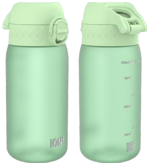
I8RF350SGRE2 RECYCLON - 350ML SURF GREEN