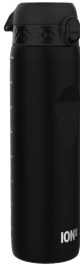
I8RF1000BLK RECYCLON - 1000ML BLACK