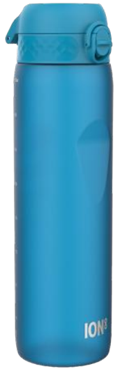
I8RF1000BLU RECYCLON - 1000ML BLUE