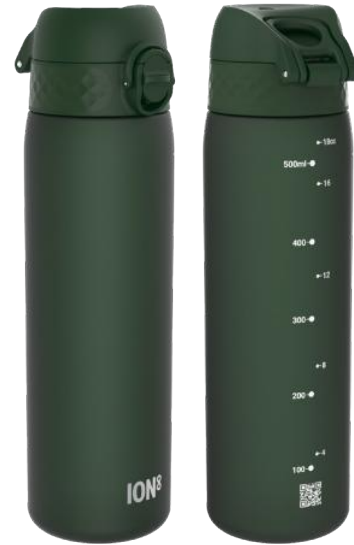
I8RF500DGRE RECYCLON - 500ML DARK GREEN