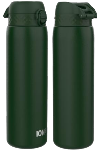
18TS1000DGRE INSULATED STEEL - 920ML DARK GREEN NEW