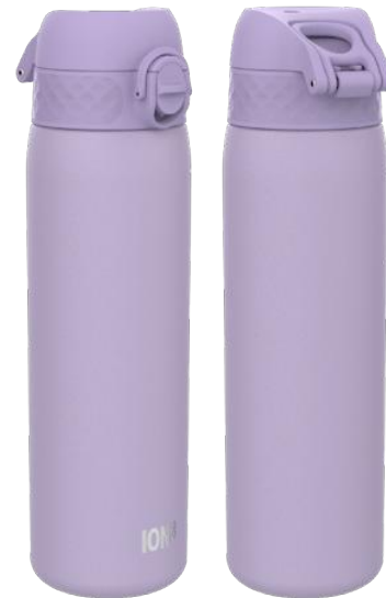
I8TS500PERI INSULATED STEEL - 500ML PERIWINKLE