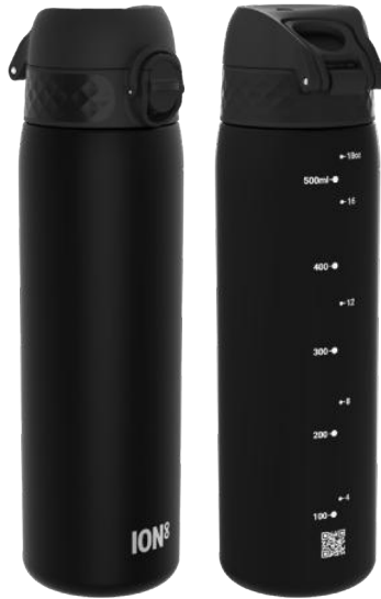
I8RF500BLK RECYCLON - 500ML BLACK