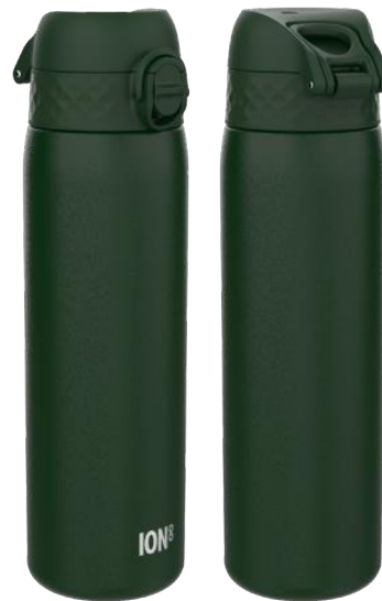
18SS600DGRE STAINLESS STEEL - 600ML DARK GREEN