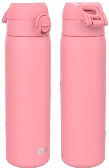
I8TS500ROSEB INSULATED STEEL - 500ML ROSE BLOOM