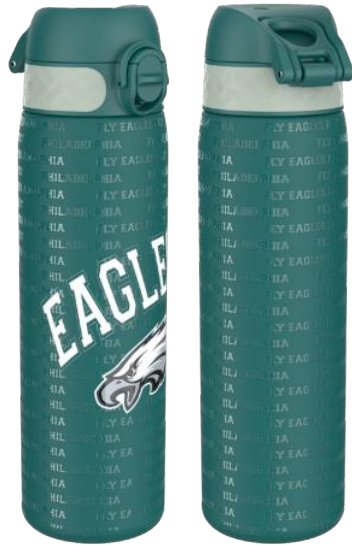
18SS600NFLPHI STAINLESS STEEL - 600ML PHILADELPHIA EAGLES