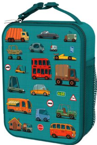
I8LBAAUTO LUNCH BAG AUTOMOBILES