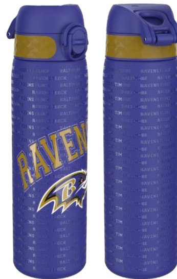
18SS600NFLCBAL STAINLESS STEEL - 600ML BALTIMORE RAVENS