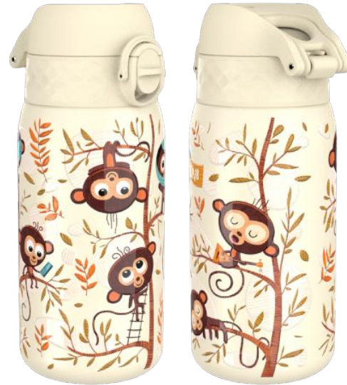
18SS400PYMONK STAINLESS STEEL - 400ML MONKEYS