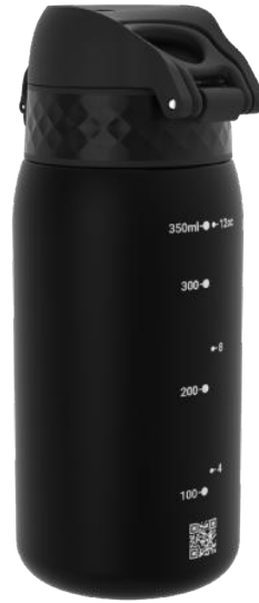
I8RF350BLK RECYCLON - 350ML BLACK