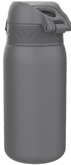
I8TS320GRY INSULATED STEEL - 320ML GREY