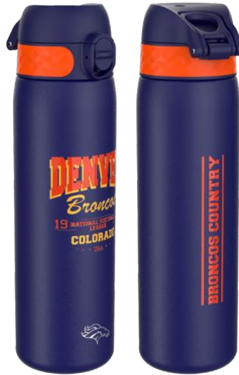
I8SS600NFLEDEN STAINLESS STEEL - 600ML DENVER BRONCOS