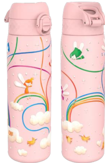
18SS600PPFAIRY STAINLESS STEEL - 600ML FAIRIES