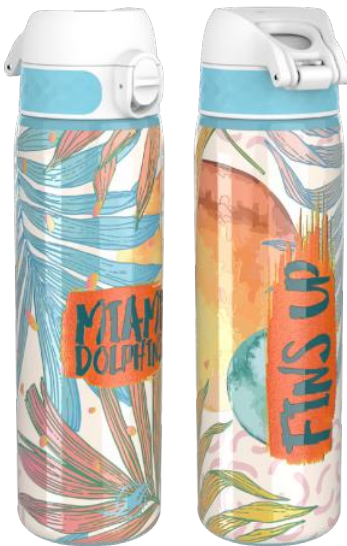
I8SS600NFLEMIA STAINLESS STEEL - 600ML MIAMI DOLPHINS