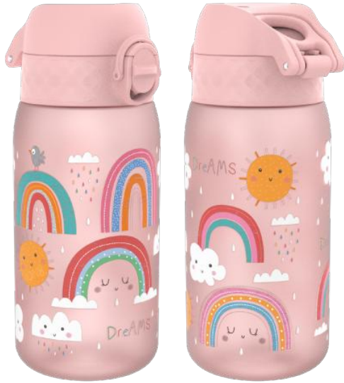
I8RF350PPRAINB RECYCLON - 350ML RAINBOWS