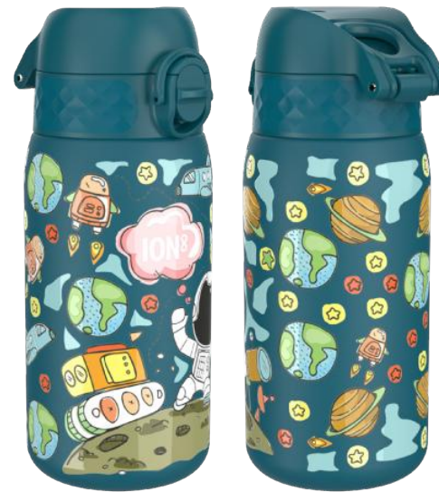
I8SS400PTSPACE STAINLESS STEEL - 400ML SPACE