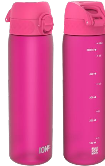
I8RF500PIN RECYCLON - 500ML PINK