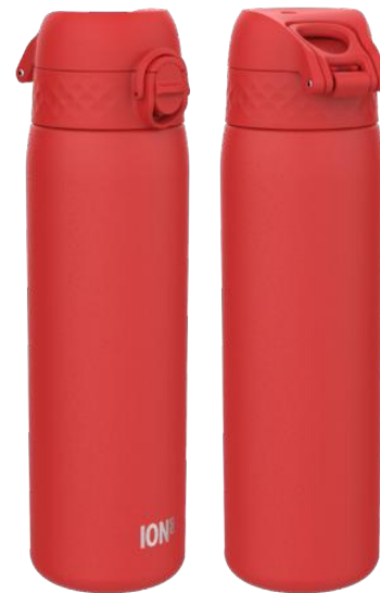
I8TS500RED INSULATED STEEL - 500ML RED