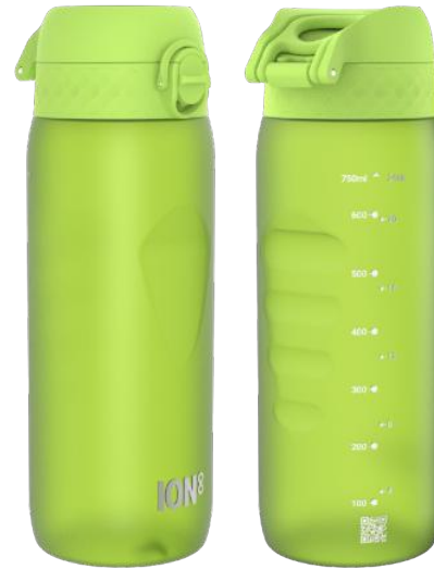
I8RF750GRE RECYCLON - 750ML GREEN