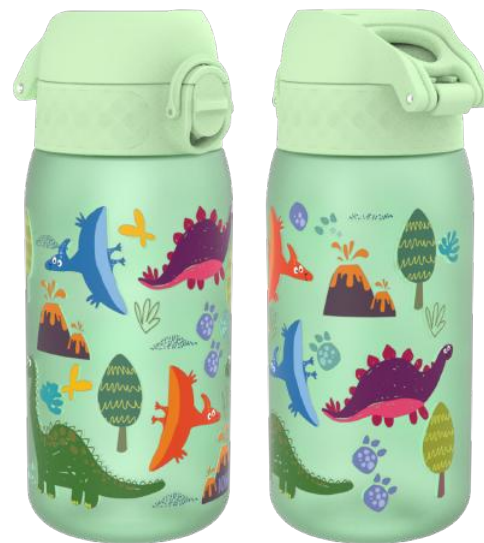
I8RF350PGDINO RECYCLON - 350ML DINOSAURS