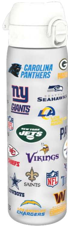
I8RF500NFLMULTI RECYCLON - 500ML MULTI TEAM DESIGN