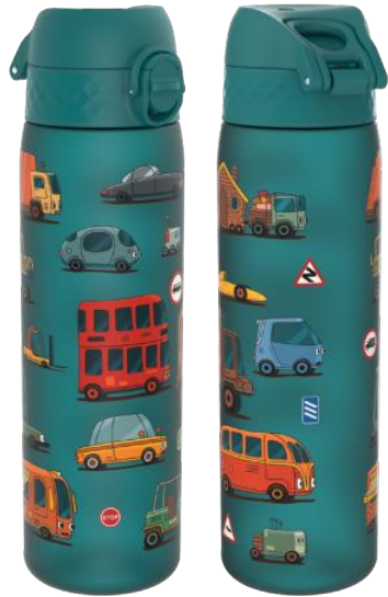
I8RF500PAAUTO RECYCLON - 500ML AUTOMOBILE