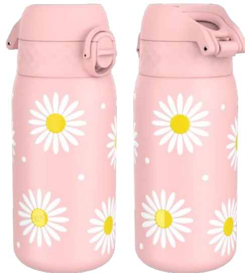
18SS400PPDAISY STAINLESS STEEL - 400ML DAISIES