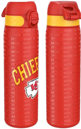
18SS600NFLCKC STAINLESS STEEL - 600ML KANSAS CITY CHIEFS