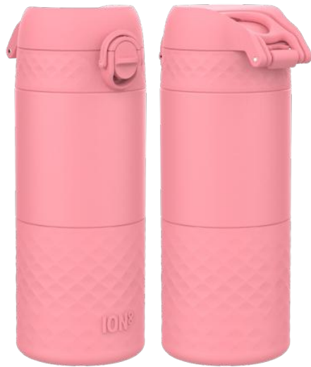
I8HS360ROSEB INSULATED STEEL - 360ML ROSE BLOOM