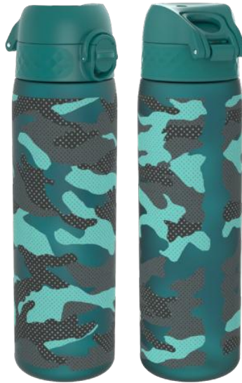
I8RF500PACAMOU RECYCLON - 500ML CAMOU