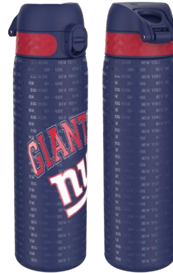
18SS600NFLCNYG STAINLESS STEEL - 600ML NEW YORK GIANTS