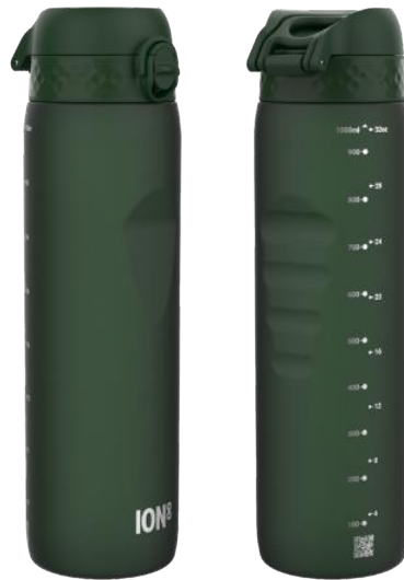
I8RF1000DGRE RECYCLON - 1000ML DARK GREEN