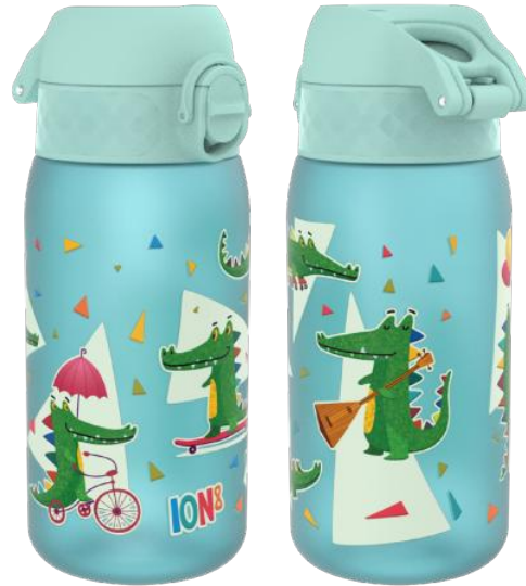
I8RF350PBCROC RECYCLON - 350ML CROCODILES