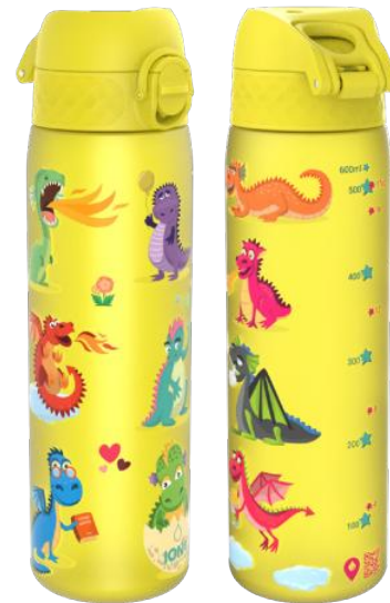
I8RF500PYDRAG RECYCLON - 500ML DRAGONS