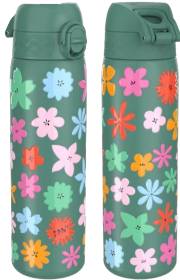
18SS600PGFLO STAINLESS STEEL - 600ML FLORAL