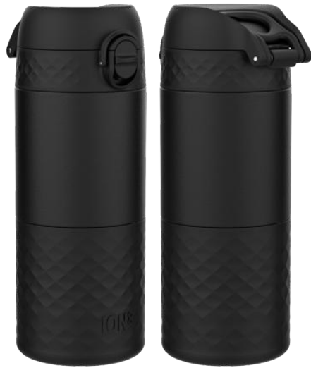
I8HS360BLK INSULATED STEEL - 360ML BLACK