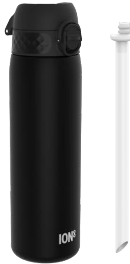
I8RF500BLKXS BOTTLE & STRAW BLACK