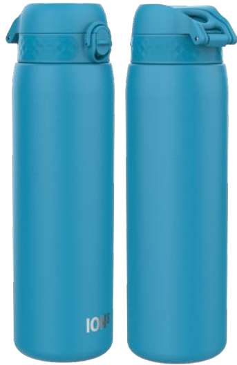
I8TS1000BLU INSULATED STEEL - 920ML BLUE