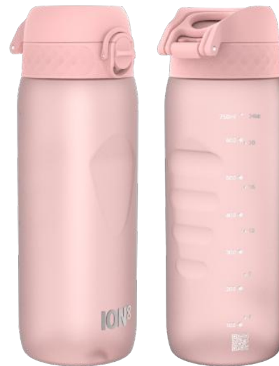
I8RF750ROS RECYCLON - 750ML ROSE QUARTZ