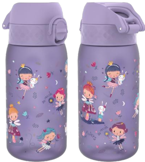
I8RF350PVFAIRY RECYCLON - 350ML FAIRIES