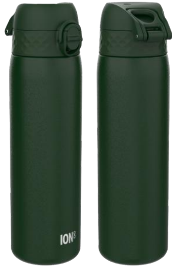
I8TS500DGRE INSULATED STEEL - 500ML DARK GREEN