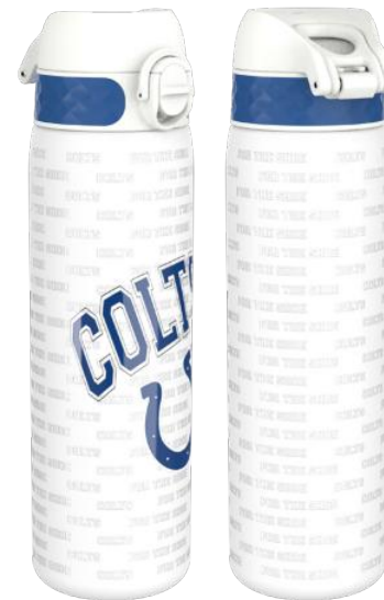
18SS600NFCIND STAINLESS STEEL - 600ML INDIANAPOLIS COLTS