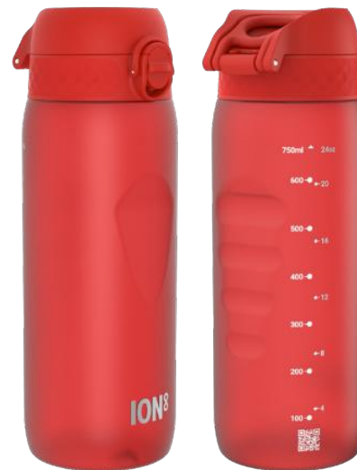
I8RF750RED RECYCLON - 750ML RED