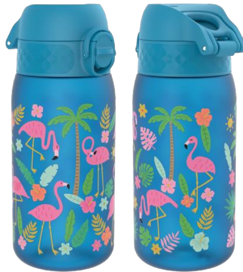
I8RF350PBFLAM RECYCLON - 350ML FLAMINGOS