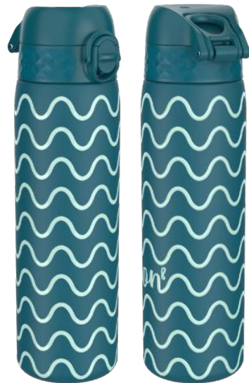
I8TS500PTWAVE INSULATED STEEL - 500ML WAVE