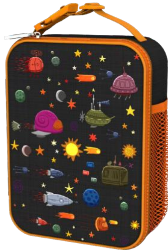
18LBKSPACE LUNCH BAG SPACESHIPS