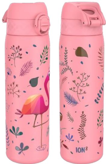
18SS600PPFLATEA STAINLESS STEEL - 600ML FLAMINGO